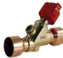
The electronic expansion valve allows an improvement of performance.