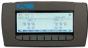
Semigraphic user interface with multifunctional buttons and dynamic display icons.